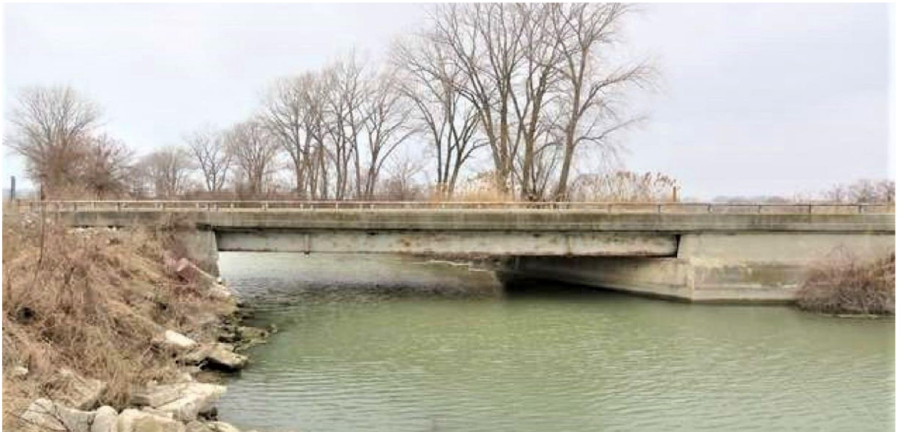
Figure 1. Photo of the existing Heron Line Bridge over the Rivard Drain