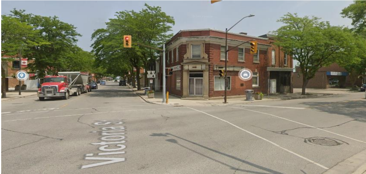
Figure 1: Intersection of Victoria Street and London Road

Due to the skew of the intersection and the tight (approximately 5 m) curb radius, as shown in Figure 1 below, large trucks can encounter difficulty when negotiating the northbound right turn. Based on field reviews by staff, it was determined that the rear wheels of semi-trucks can run up onto the sidewalk when making this turn, resulting in the trailer striking traffic signal poles at the intersection as well as general concerns regarding pedestrian safety.