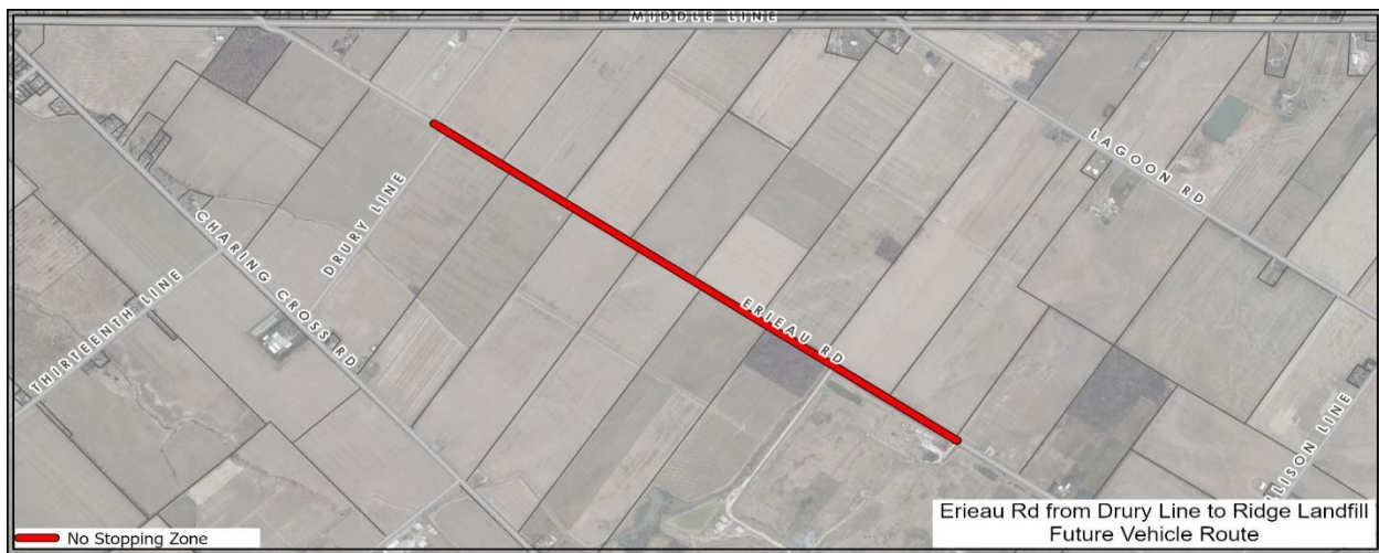
Figure 3: No stopping zone on Erieau Road

A No Stopping zone on both sides of Erieau Road between Drury Line and Ridge Landfill Gate 3 (2.5 km) is recommended, as shown in the Figure 3 below.